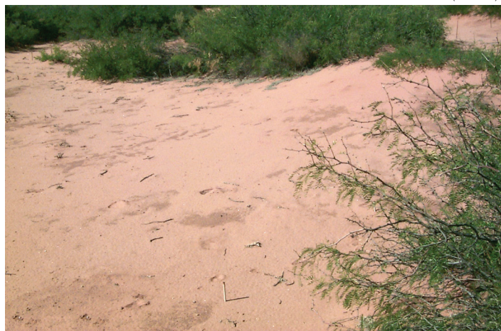
In 2003, at the end of a long drought, mesquite and bare soil dominate a study site at the Jornada Experimental Range.