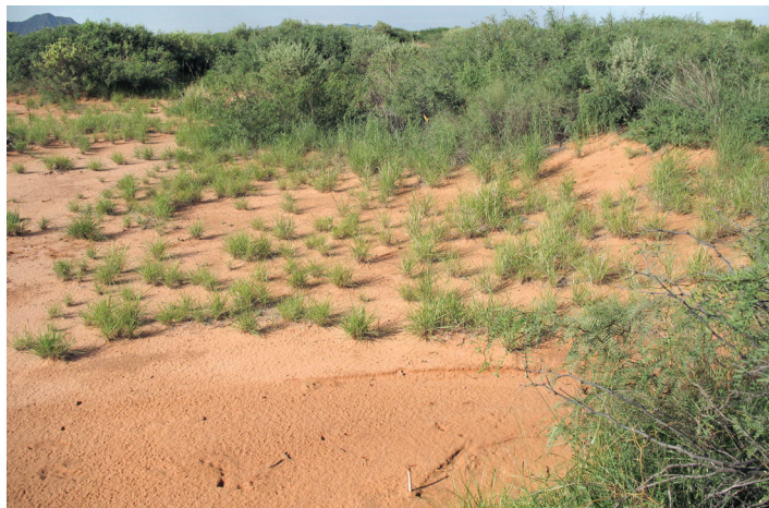
By 2008, after 5 consecutive wet years, perennial grasses were growing in the previously bare spaces between and around the shrubs.

biomass and litter on the soil surface," Peters says. "When it rains hard on the Jornada, the water runs across the soil surface as sheet flow, but the accumulating biomass dams the flow. All of this makes conditions even better for grass growth, because there's an increase in the level of soil moisture and the organic matter that supports plant growth, which allows survival even when conditions become dry again. In addition, the established grass survives long enough to put out seed to continue the cycle."